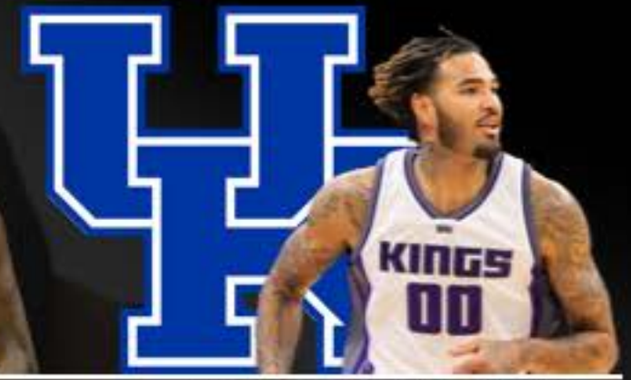
WILLIE CAULEY STEIN KENTUCKY UNIVERSITY SACRAMENTO KINGS