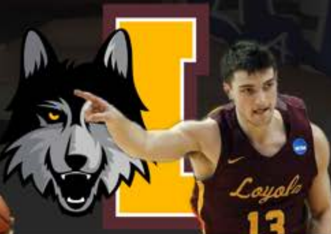
CLAYTON CUSTER LOYOLA - CHICAGO MVC PLAYER OF THE YEAR NCAA FINAL FOUR TEAM