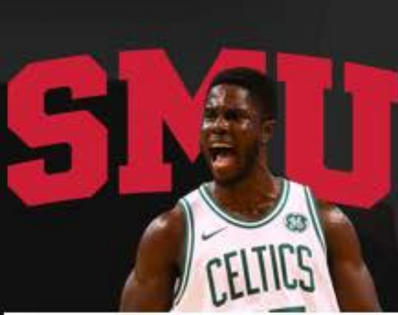
SEMI OJELEYE SOUTHERN METHODIST UNIVERSITY BOSTON CELTICS AAC PLAYER OF THE YEAR