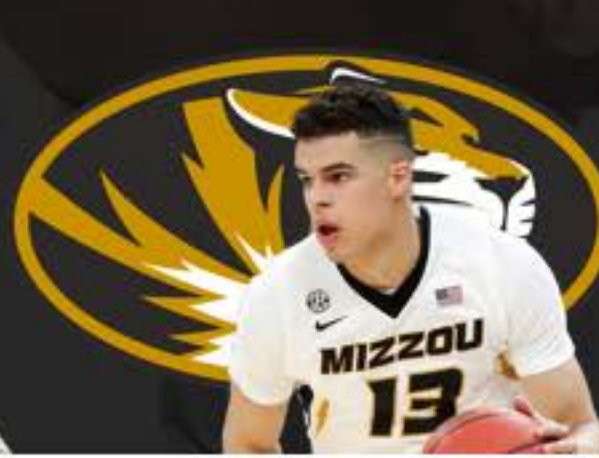
MICHAEL PORTER JR. UNIVERSITY OF MISSOURI McDONALD'S ALL-AMERICAN