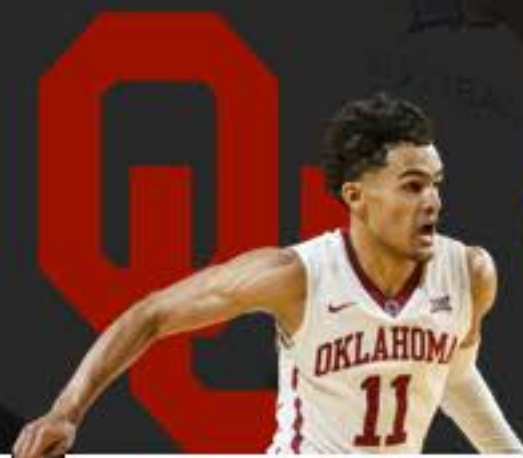
TRAE YOUNG UNIVERSITY OF OKLAHOMA McDONALD'S ALL-AMERICAN BIG 12 FRESHMAN OF THE YEAR